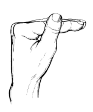
2. Knuckle bent with straight fingers